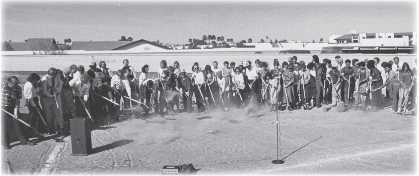
An official groundbreaking ceremony was held in 1987 for the Daily News-Sun's offices located at 10102 W. Santa Fe Drive in Sun City. The newspaper moved from a smaller building on Santa Fe into the newly expanded offices and print facility.