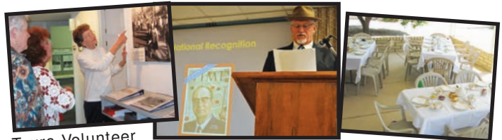
Tours, Volunteer Opportunities