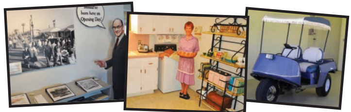
Exhibits, Historical Artifacts and More!