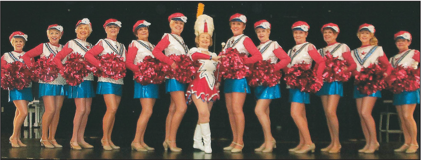
The Jazzy Poms of the Rhythm Tappers of Sun City West will perform at the gala.