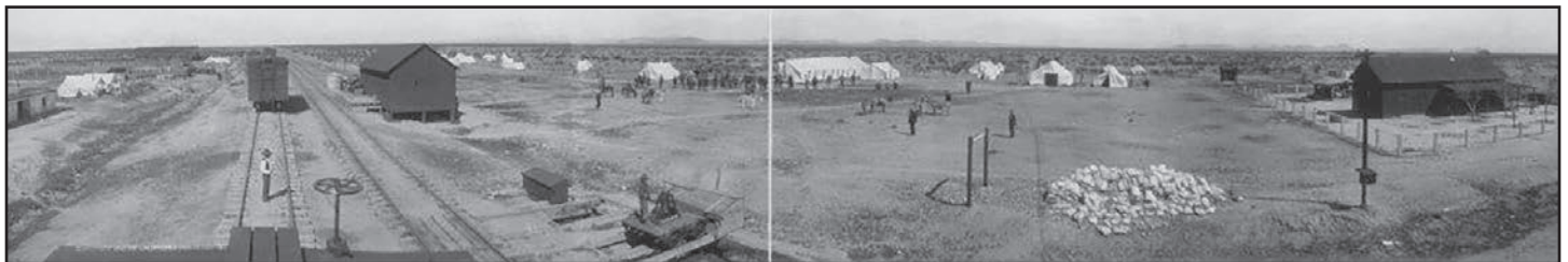
A photograph of Beardsley, Arizona, from the Library of Congress.