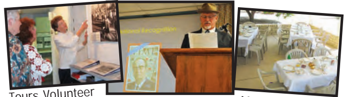
Tours, Volunteer Opportunities