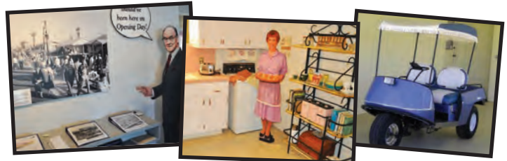
Exhibits, Historical Artifacts and More!