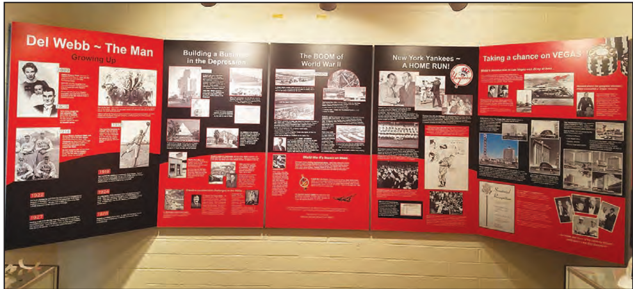
The official colors of the Webb Corporation were red and black – Webb's favorite colors. They provide a dramatic backdrop for the story of his life and the company he built.