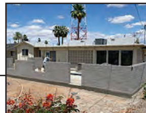
May 24 Work begins on block walls.