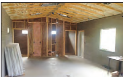
Aug. 1 Works begins on the interior.