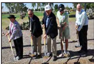
March 28, 2019 Official groundbreaking ceremonies.