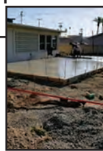
May 17 Foundation poured.