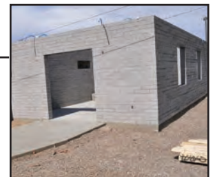
June 24 Ready for roof work to begin.