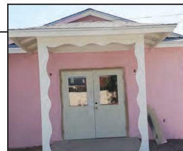
Sept. 30 Addition is painted and nearly complete.