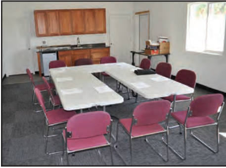
The museum's new gallery includes space for expanded exhibits, museum talks and community meetings.