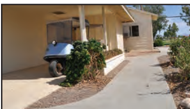
June 25 A new sidewalk will take visitors to a new handicapped-accessible entrance.