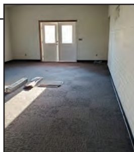
Sept. 4 New carpet installed; interior work progresses.