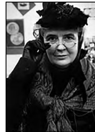
Susan B. Anthony

It was the development of Youngtown that captured the attention of officials from the Del Webb Corporation in the late 1950s, which led ultimately to the company's plan to purchase the land east of Youngtown and develop Sun City.