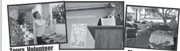
Tours, Volunteer Opportunities, Speakers Bureau, Meeting Facilities