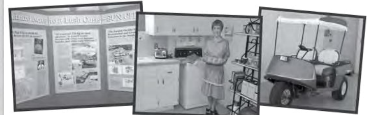
Exhibits, Historical Artifacts and More!

The past comes to life at the only museum in the nation devoted to the world's very first active adult retirement communities! Located in the first of five model homes built in Sun City, the museum offers a living tribute to the history of Sun City and Sun City West, and to the enduring spirit of those who pioneered an exciting new lifestyle!