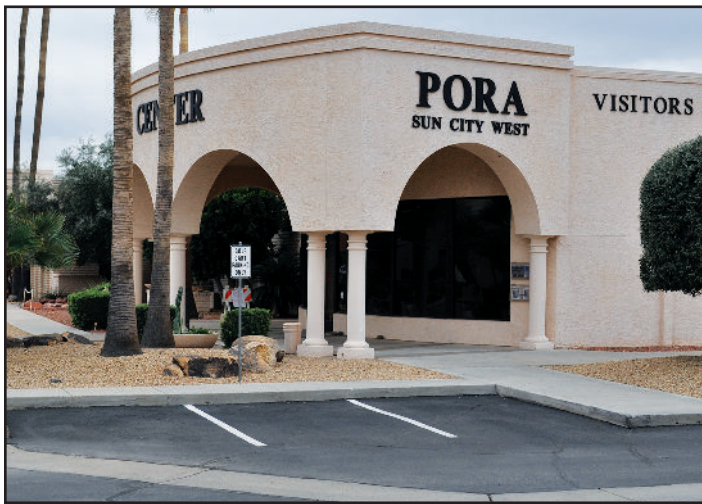
The Sun City West Visitors Center under construction, left, and as it appears today, right.