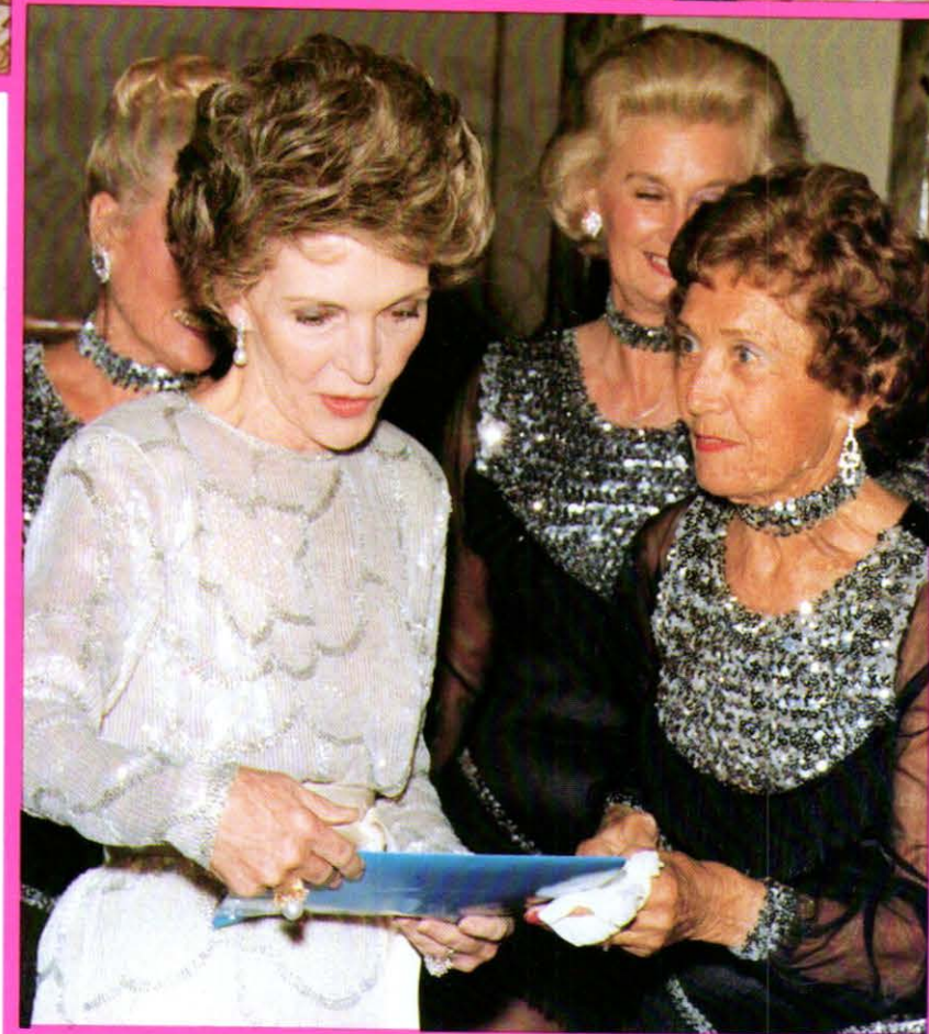
The highlight of the Pom Poms' travels came in 1985 when the group was asked to perform at the annual fundraiser for the National Fitness Foundation in New York City, where First Lady Nancy Reagan was the guest of honor.