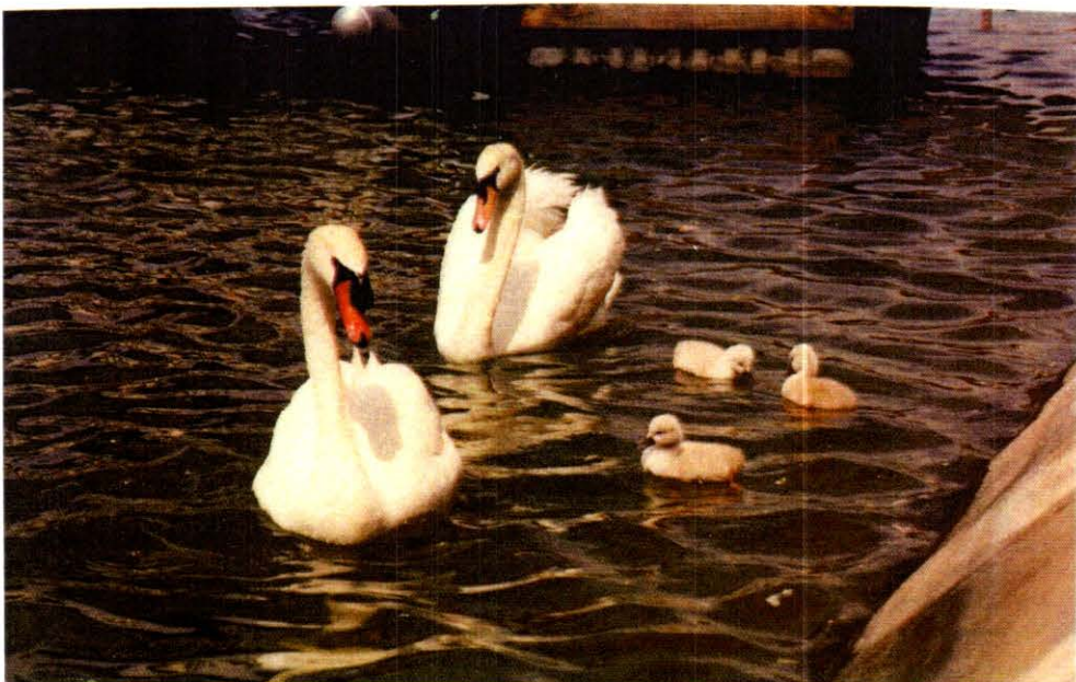
Royal and Thunderbird