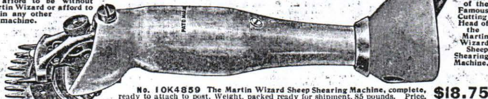
Side View of the Famous Cutting Head of the Martin Wizard Sheep Shearing Machine.

OK4850 Martin Wizard Driving Power with Martin Standard Head. Price, $15.75 OK4863 Comb Guard Attachment for the Wizard Head, enabling the shearer to run 1/4 to 1/2 of an inch of wool on the sheep's back to protect it from the sun. Price, 1.00