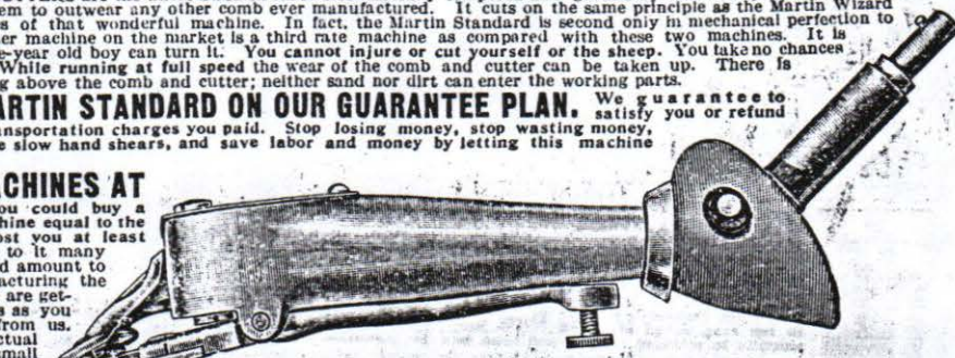
Side View of the Martin Standard Shearing Head.

EXTRA COMBS AND CUTTERS. No. 311 Comb or Under Plate. Price, each, 80c