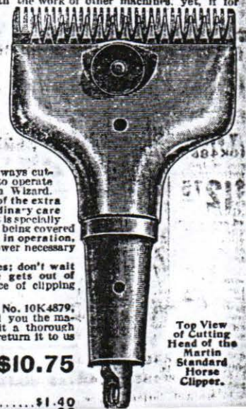
Top View of Cutting Head of the Martin Standard Horse Clipper.